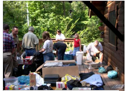
Packing the 22 bags taken to Uganda, crammed with gifts from churches and individuals