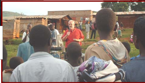
We preached, with able interpreters, in an area known for drunkenness.