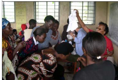
Gifts distributed at Fort Portal, Uganda