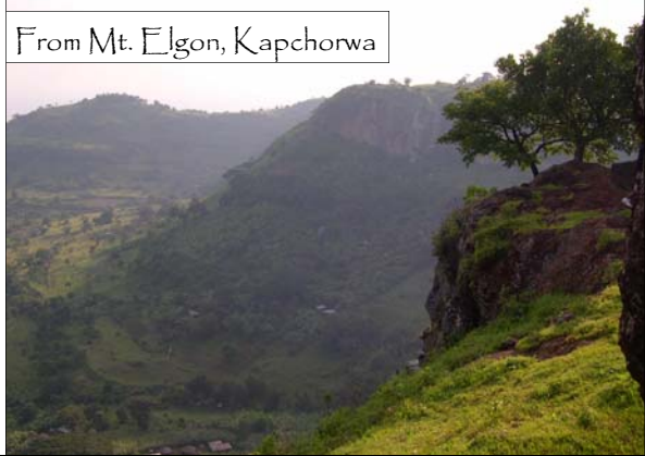
From Mt. Elgon, Kapchorwa