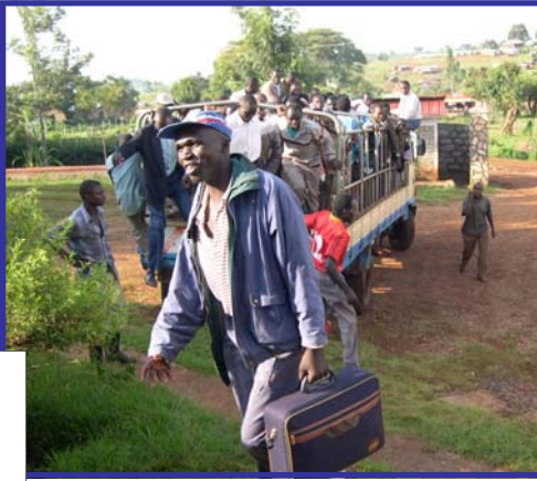
A truckload of Brothers eager to learn at Kapchor-