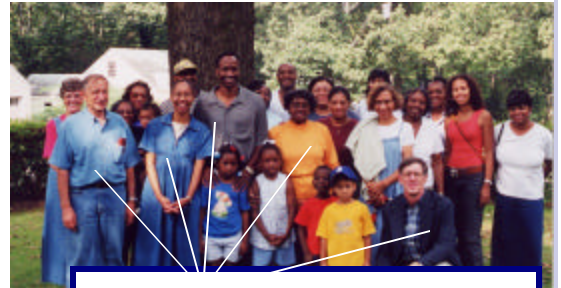
Uganda 2001 Team and Sendoff