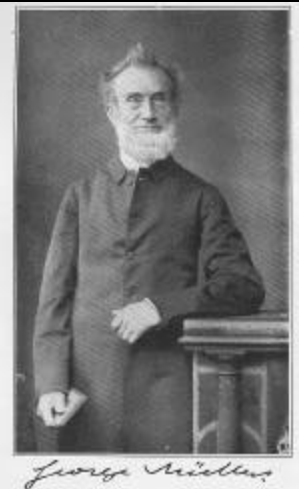
From 1899 ed. of biography