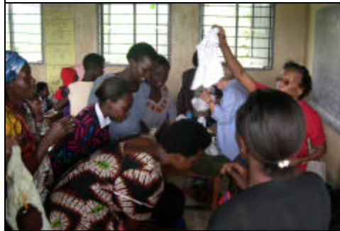
Gifts distributed at Fort Portal, Uganda