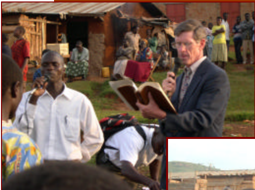
We preached, with able interpreters, in an area known for drunkenness.