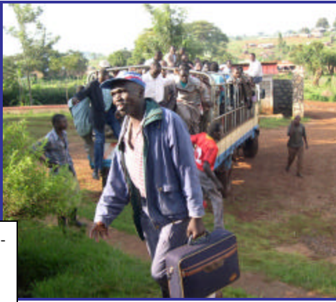
A truckload of Brothers eager to learn at Kapchorwa!