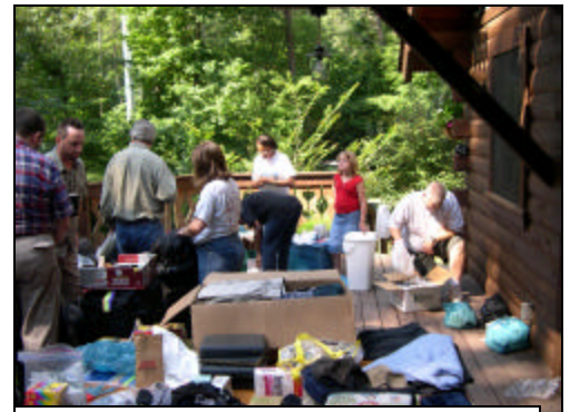
Packing the 22 bags taken to Uganda, crammed with gifts from churches and individuals