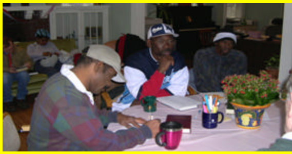
Teaching basic Christian finances in Chattanooga.